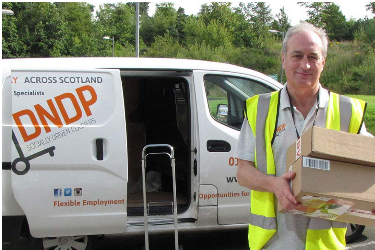
Delivered Next Day Personally (DNDP) raised £50,000 investment through SITR