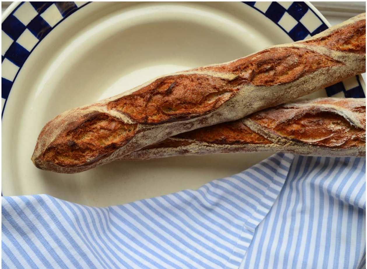
The finished product 48 hours later - Freedom's baguettes

It's worth noting that the process of taking on SITR investment does not just bring capital, it also broadens networks and brings additional expertise to the mix. One investor with relevant industry experience has even joined Freedom's Advisory Board and another acts as an advisor, whose expertise we're able to draw on whenever needed.