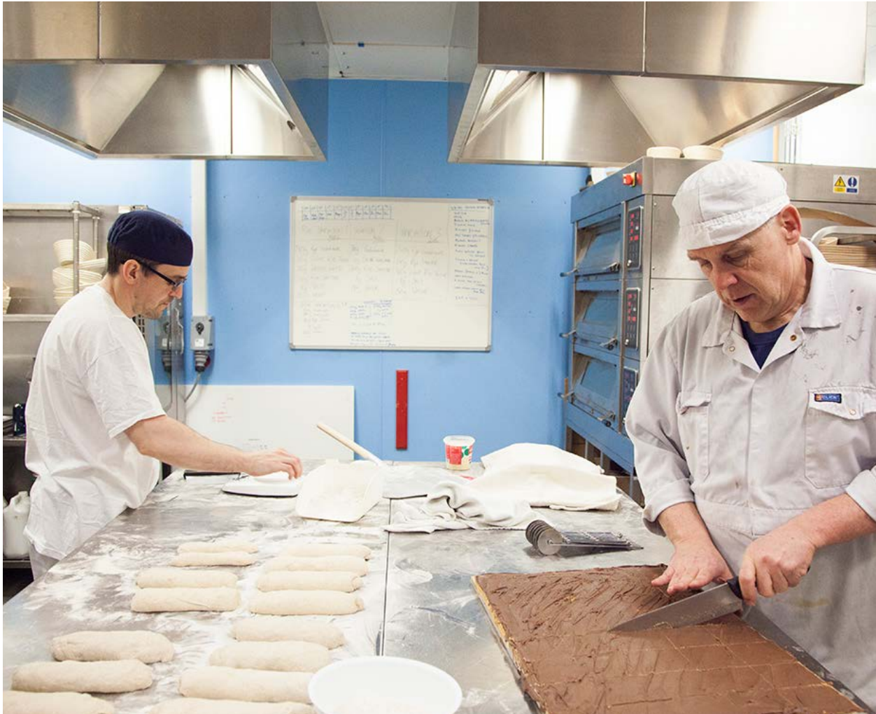
Freedom Bakery kitchen at HMP Low Moss - trainee bakers prepping orders