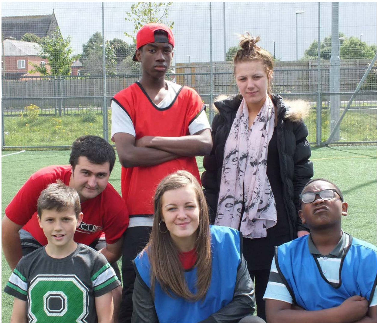
FC United of Manchester raised £270,000 investment through SITR

This guide focuses on raising finance via SITR loans rather than selling equity as most charities and social enterprises are unable to sell shares. Some of this procedural guidance is not currently covered by existing government guidance.