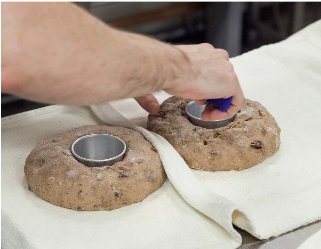
Freedom's rye and walnut breads being prepped prior to baking

Although this guide gives you the essential information you need to prepare your own SITR deal - enabling you to do a lot of the groundwork yourself - final checks by a lawyer and a tax specialist are highly recommended. In our case, the tax specialist suggested some changes to the legal wording of our application and submitted it on Freedom's behalf.