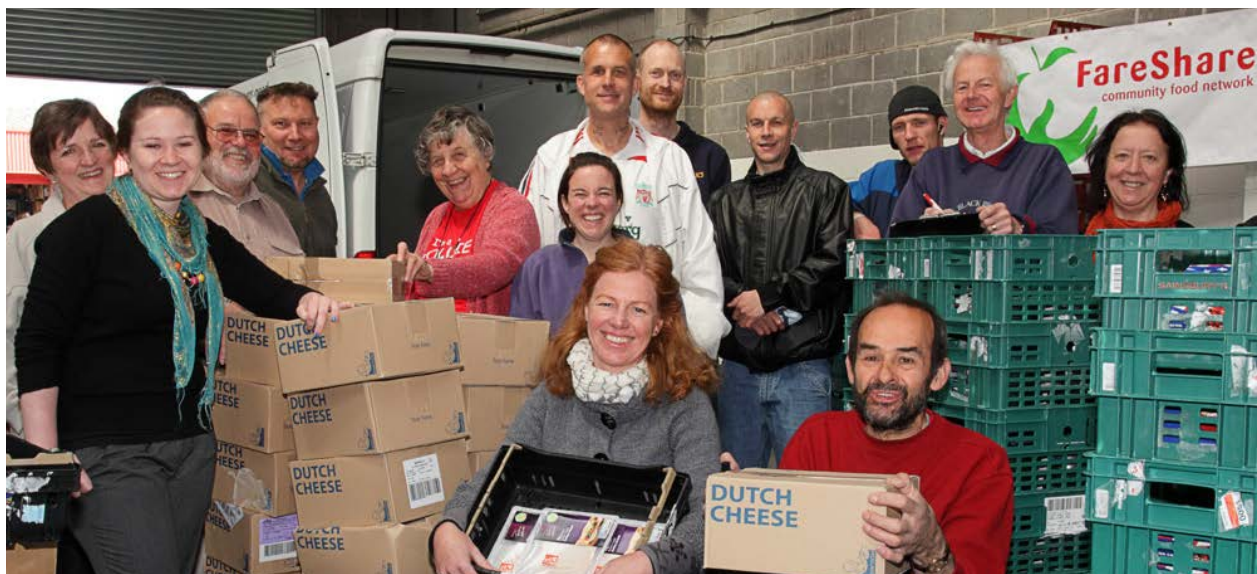
FareShare SouthWest raised £70,000 investment through SITR